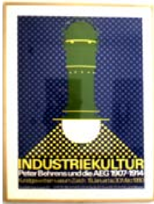
N TROXLER INDUSTRIEL KULTUR PRINT

LOCATION: LEONARD LAUDER HALL:GROUND FLOOR:LOBBY