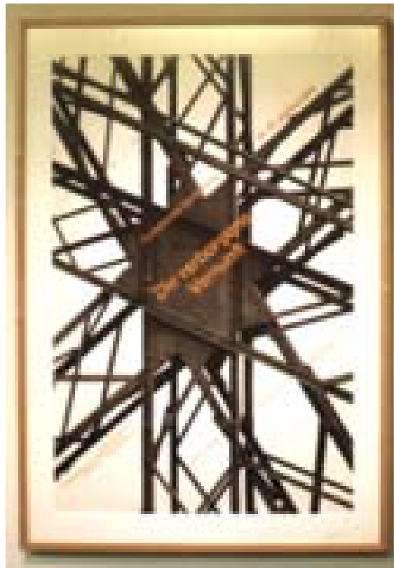
UNKNOWN ARTIST DIE VERBORGENE VERNUNFT PRINT 47 x 33 INCHES

LOCATION: LEONARD LAUDER HALL:GROUND:FLOOR LOBBY