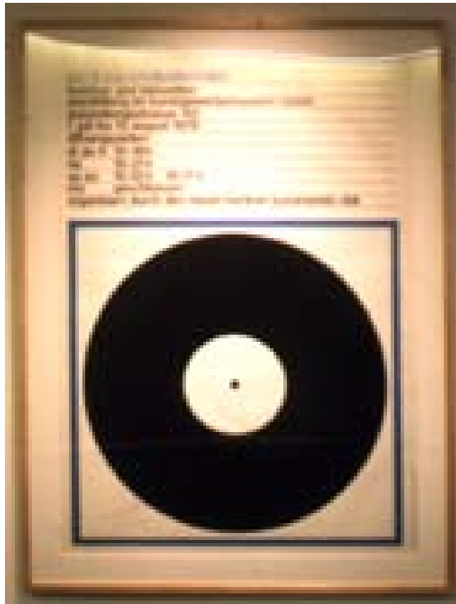
MARKUS BRUGGISSER JAZZ AND POP SCHALLPLATENBULLE PRINT

LOCATION: LEONARD LAUDER HALL:GROUND FLOOR:LOBBY