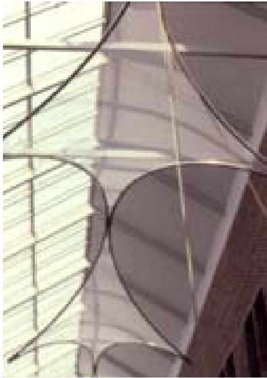
NICK VIDNOVIC UNTITLED METAL 25 x 150 x 20 FEET

LOCATION: STEINBERG-DIETRICH HALL: ATRIUM