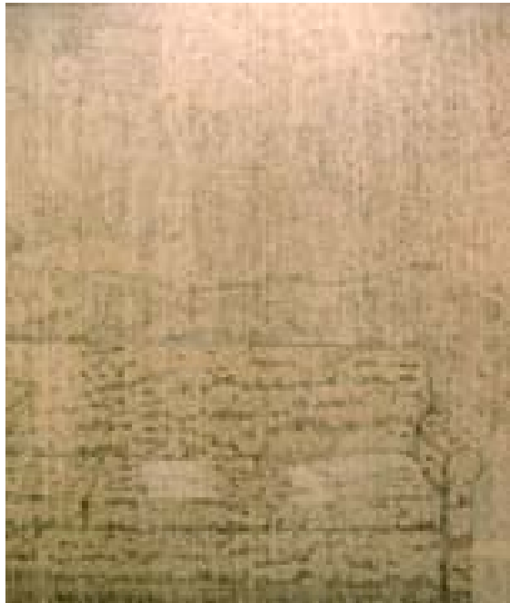
GEORGE CHEMECHE (b.1934) THE COUCH OIL ON CANVAS 72 x 60 1/4 INCHES

LOCATION: STEINBERG-DIETRICH HALL:350 LOBBY AREA