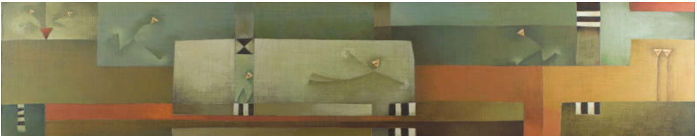
ANTONIA GUZMAN (b. 1954) ESPACIOS DE LIBERTAD, AUGUST 2009 ACRYLIC ON SANDED CANVAS 21 1/2 x 89 INCHES

LOCATION: STEINBERG-DIETRICH HALL:LOWER LEVEL:350 LOBBY AREA