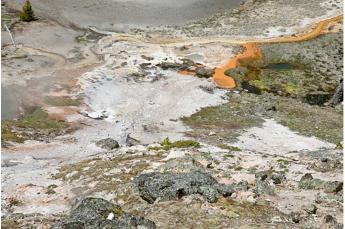
DIANE BURKO (b. 1945) MIDWAY GEYSER 2, JUNE 3, 2011 ARCHIVAL INKJET PRINT ON CANSON ETCHING RAG 40 x 60 INCHES

LOCATION: STEINBERG-DIETRICH HALL:LOWER LEVEL:CORRIDOR